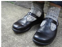
Black School shoes

A Healthy Packed lunch Can you practise opening your lunch box by yourself?