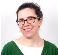
Miss Walter Foundation Stage Coordinator