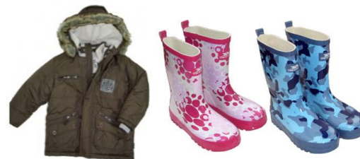
Coat & Wellies

Please make sure all your belongings are labelled with your name! It would be great if you could practise putting on your shoes and doing up your coat.